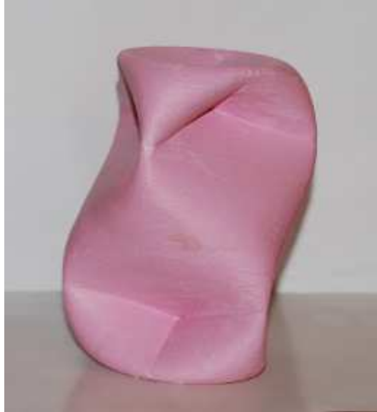
FIGURE 12. Etruscan Venus