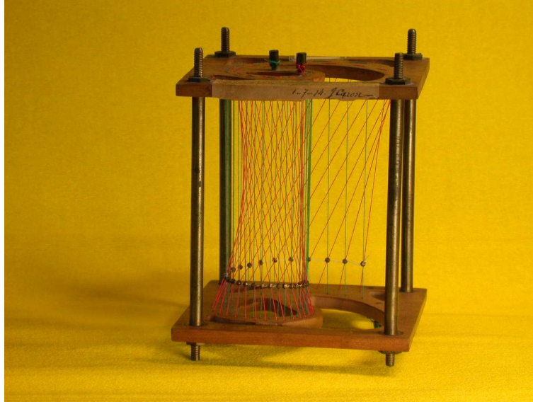
FIGURE 10. Intersection of two surfaces

On a wooden cone divided into two parts in order to make two inscribed wooden spheres visible, one notices, on one hand, a brace rod figuring a generating line of the cone, and, on the other hand, a metallic ellipse whose plane is tangent to both wooden spheres. The points of tangency on the spheres materialize the focus of the ellipse (first part of Dandelin theorem), whereas the touching circles of the spheres with the cone define planes meeting that of the ellipse along its directrices (second part of Dandelin theorem).