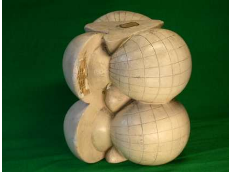
FIGURE 11. Sievert surface

revolution cylinder, that is by connecting (with a red sewing thread) the generic point of the upper spiral, with the point of the lower spiral the polar angle of which being shifted by a constant. The intersection curve of the two surfaces occurs as a sequence of small pearls.