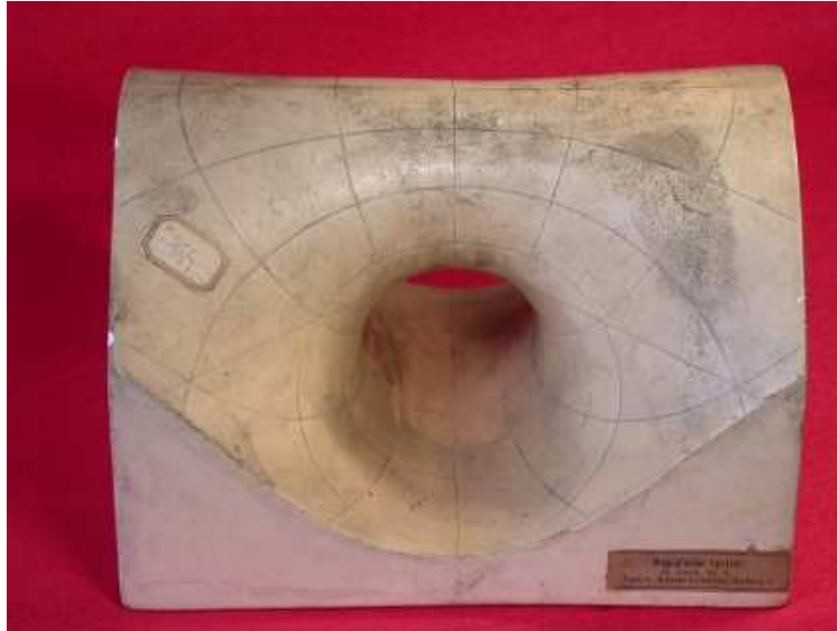
FIGURE 8. Ring parabolic cyclid