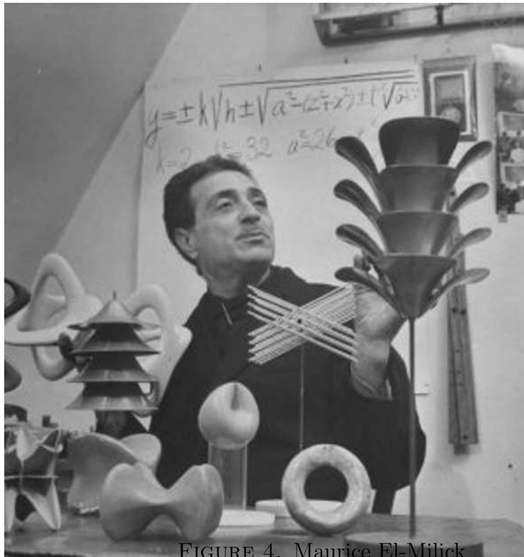
FIGURE 4. Maurice El-Milick

is a smooth cubic, that is without any singular point. In 1858 Ludwig Schläfli got the idea to classify such surfaces according to their number of real lines: provided that the cubic surface is not ruled, then it falls into only four different types in reference to the value 3, 7, 15 or 27 of that number. In the present case, the surface contains seven real lines, six of which being visible, and the seventh being cast aside at infinity. In addition, the surface is generated by ellipses, some of them are circles and are shown on the model. The choice of the curves materialized by the wire preserves the invariance under the group of space isometries leaving the surface globally unchanged, which is isomorphic to the 8-order dihedral group and generated by the two following linear transformations: