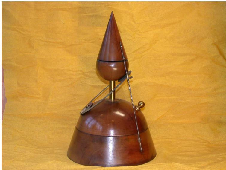
FIGURE 9. Dandelin model