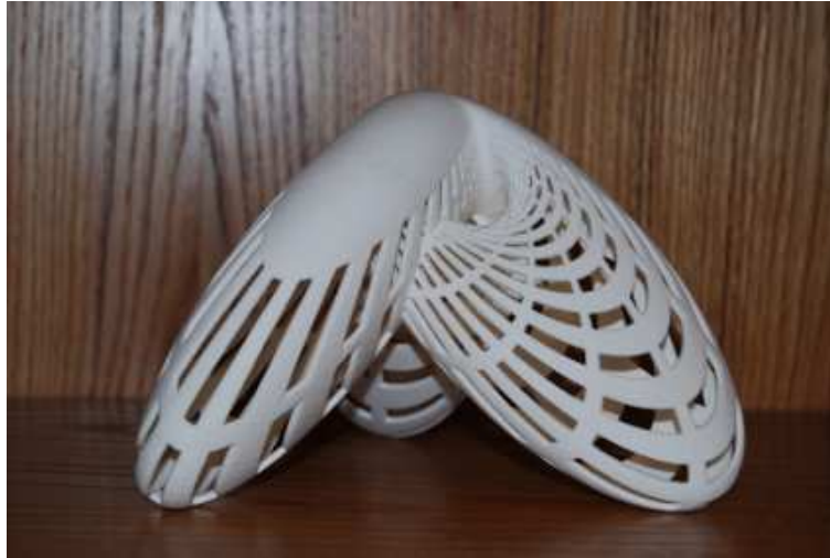
FIGURE 13. Boy surface of degree six