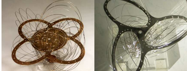
FIGURE 1. Two wire models realized by the author

lead to a physical realization that, in addition, especially when it is the unique solution of a natural problem, enjoys plastic qualities that artist souls, like surrealists in the thirties, can take over. One can not refrain from combining visual and tactile pleasure, without depriving oneself of the feeling of substance and materials. Virtual imaging is excellent but it is not all. It is sometimes difficult to develop a correct mental image without having the object to hand.