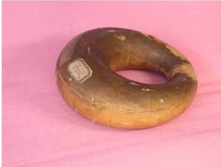
FIGURE 5. Ring Dupin cyclid