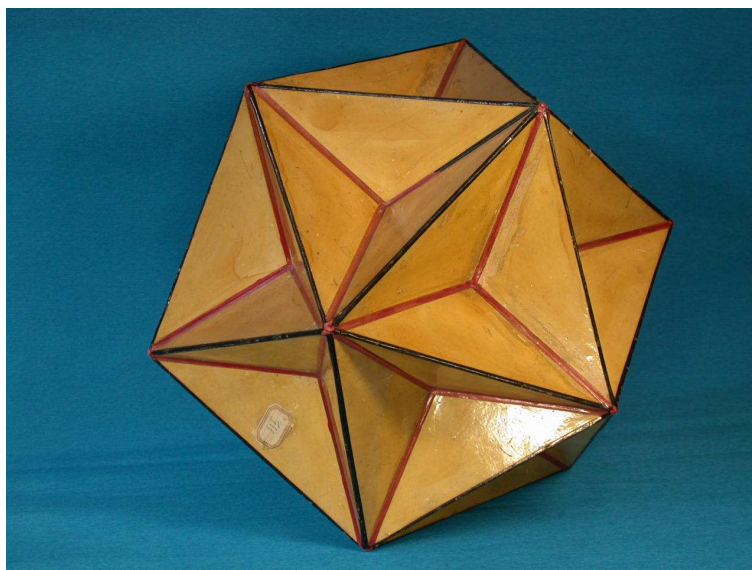
FIGURE 6. The great dodecahedron