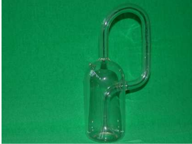
FIGURE 2. Klein bottle

of Klein bottle, although according to some historians, its origin would rest on a confusion between the german words “Flasche” and “Fläche”.