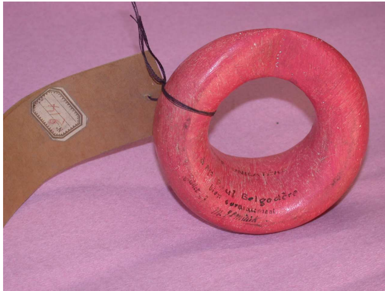
FIGURE 3. The one-sided cyclid

segment. Up to ambient isotopy, the mapping remains unchanged by a small perturbation.