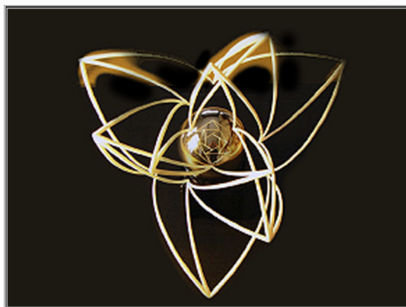
3D anamorphosis. 40cmx40cm*20cm. Wood and plastic.